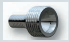
Male multi-purpose quick couplings for safety clamps