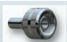
Female multi-purpose quick couplings for safety clamps