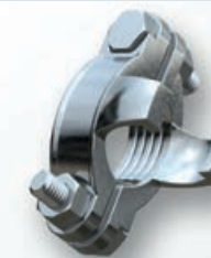
Hose clamp DIN 20039 B with safety claw