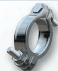
Hose clamp DIN 20039 A