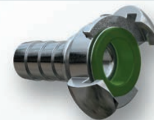
Coupling with hose fitting and annular security collar