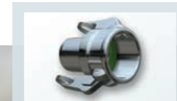
Female couplings with hose fitting and safety handles