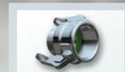
Female couplings with male thread and safety handles