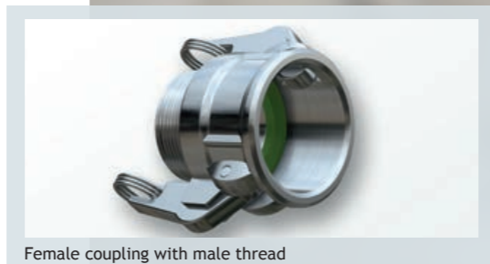
Female coupling with male thread