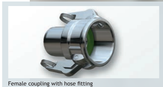
Female coupling with hose fitting