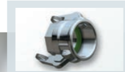
Female couplings with female thread and safety handles