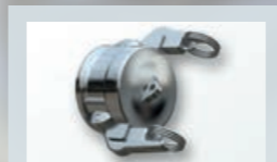
Caps with safety handles